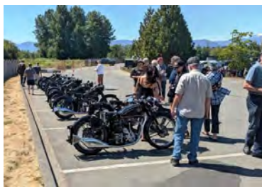
Show and Shine