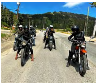
On the road

Alan Comfort, Roberts Creek, BC