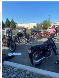
Pre ride Preparations