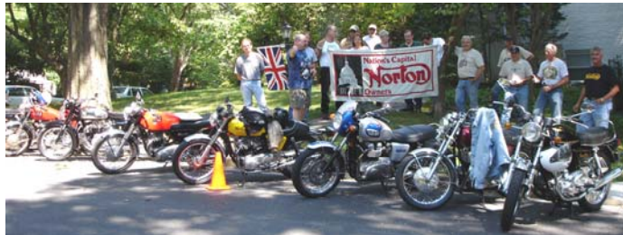
NCNO Monthly Meeting – Everyone Welcome!

www.BritishOnly.com , Garden City MI: Large stock British parts. $25 min order required. No frills site - OEM part #s needed.